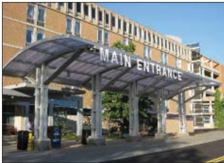
# 24359 UPMC Passavant Hospital - Model CRP custom drop off canopy