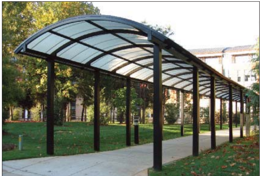
#16855 Lowes Corporate Campus, Clearspan Model CRP walkway cover