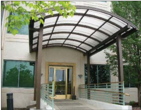
#20542 Two Conway Park - Clearspan Model CRP Canopy