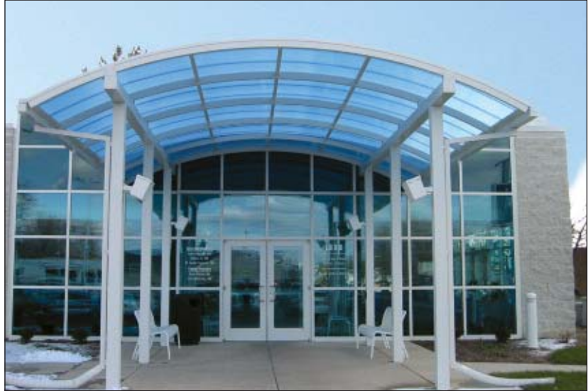
#18212 Springfield Urgent Care Center entry canopy Model CRP with gutters and down spouts by CPI, backlighting by others