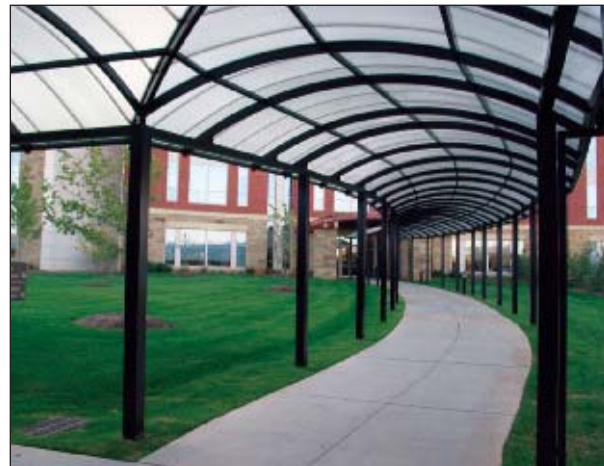
#16855 Lowes Corporate Office - Clearspan Model CRP Walkway

WWW.CPIDAYLIGHTING.COM EASY TO DESIGN • EASY TO INSTALL