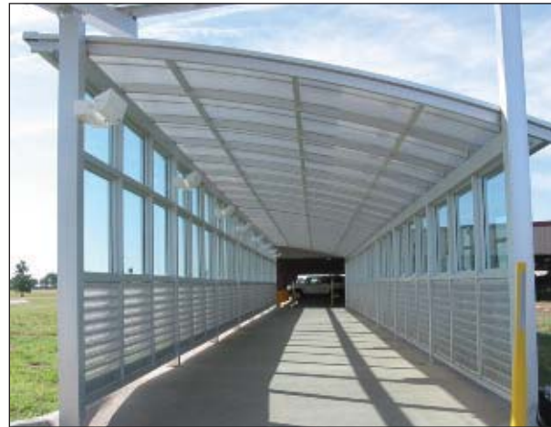
#15183 Amarillo Airport - Clearspan Model CRP Walkway with custom glass and metal louvered walls