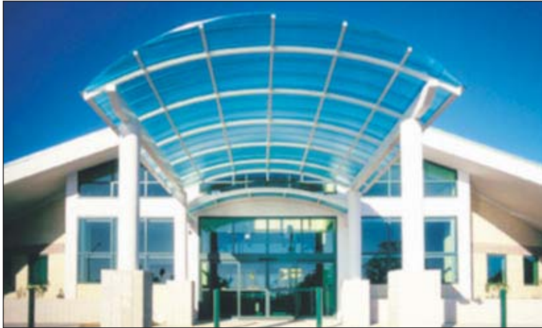
#3033 All Children's Specialty Care - Clearspan Model CRP-FLR Custom Canopy with flared front and concrete columns

Flexibility in Design... CPI's Clearspan "CRP" Canopy and Walkway system with patented Pentaglas® standing seam translucent glazing provides design flexibility that cannot be achieved with other systems. Pictured below are a variety of custom Clearspan project applications.