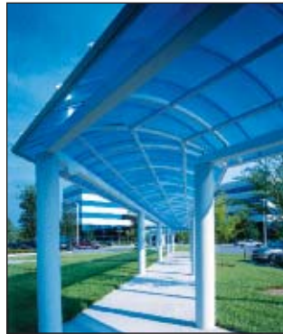
#5839 Landstar Corporate Center - Clearspan Walkway with custom concrete columns