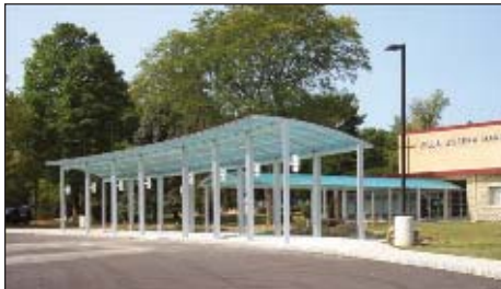
#20637 Villa Joseph Marie School - Model CRP custom walkway and drop off canopy