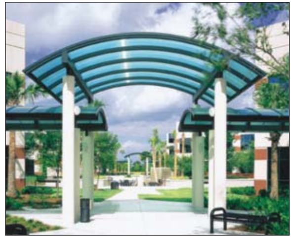
#1384 Franklin Templeton Corporate Office - Custom Clearspan Walkway system. No purlins required, rafter spacing 3.94' on center