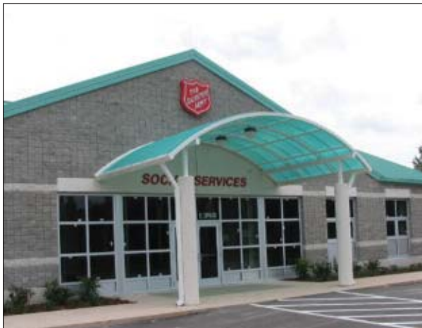
#17127 Salvation Army Service Center - Clearspan Model CRP Canopy with custom structural supports