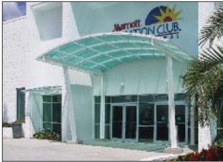
#8700 Netpark Marriott - Clearspan Canopy with custom angled columns