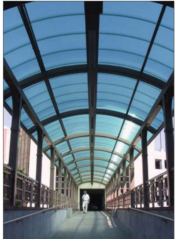
#4390 Northside Hospital - Clearspan Model CRP Walkway

CPI Representatives are ready to serve your daylighting needs. For project assistance please call 1-800-759-6985